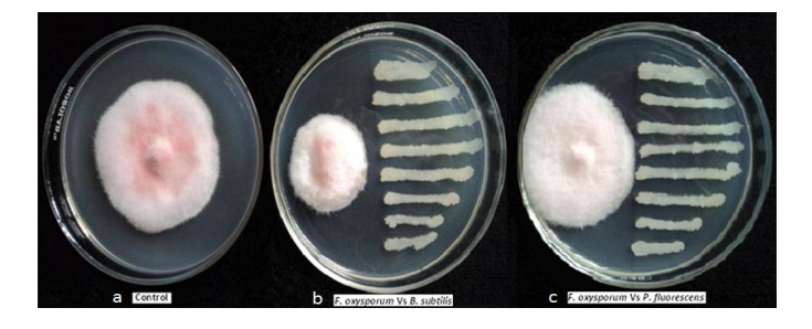
Figure 4. Dual culture plates on PDA. Control inoculated only with F. oxysporum f. sp. nicotianae (a), F. oxysporum f. sp. nicotianae Vs Bacillus subtilis (b), F. oxysporum f. sp. nicotianae Vs Pseudomonas fluorescens (c)

volatile substances derived from T. viride and T. harzianum inhibited mycelial growth of the pathogen to an extent of 72% and 56%, respectively (Figure 3). T. viride produced more inhibitory volatile metabolite when compared to that of T. harzianum . The results were on par with Pandey and Upadhyay (1997) where T. viride may be considered as a promising biocontrol agent with maximum production of volatile and non-volatile metabolic substances (Rajeswari and Kannabiran, 2011).