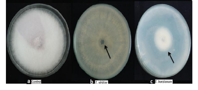
Figure 3. Effect of volatile metabolite of Trichoderma species on the growth of Fusarium oxysporum f. sp. nicotianae . F. oxysporum f. sp. nicotianae (a) alone, with Trichoderma viride (b) and Trichoderma harzianum (c). Arrow indicates the extent of growth of pathogen.

In vitro studies on the inhibitory mechanisms showed that Trichoderma cultures apparently produced volatile substances in the growth medium that suppressed the pathogen growth. The