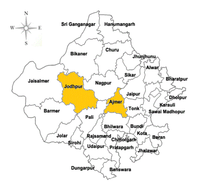
Fig. 1. Study area for diversity and distribution of spider fauna of Rajasthan

The research work was conducted in Ajmer and Jodhpur districts of Rajasthan (Fig. 1) from February 2014 to January 2015. The study area is dry tropical deciduous type. Maximum and minimum temperature recorded in winter and summer was 27°C and 4°C and 47°C and 15°C, respectively and average relative humidity (RH) was 54.8 percent. Eight sampling transects comprising four habitat types viz., woodland, marsh, pasture and caves/crevices/rocky area were selected to cover the spider diversity of the experimental region. Two transects of matching characteristics (vegetation, canopy cover, etc.) were selected for each type of habitat.