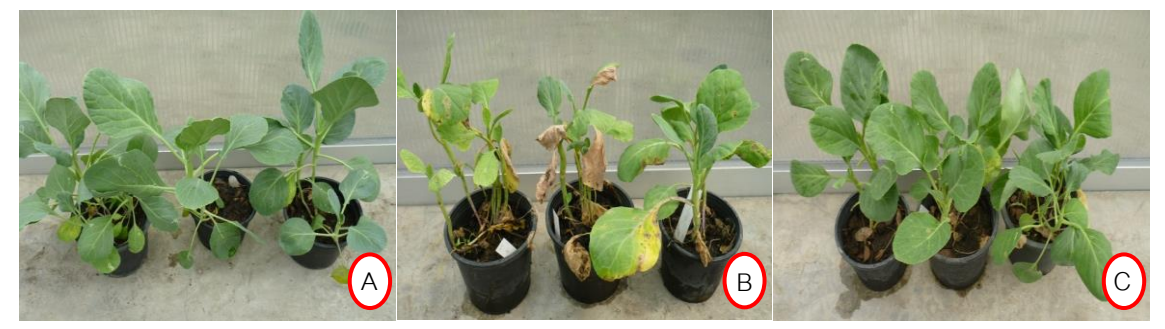
Fig. 3. In vivo antifungal activities of plant extract against A. brassicicola . Chinese kale were inoculated with spore suspensions of the test organism 1 day after spraying with the various plant extracts at concentration of 50,000 ppm for 40 days after planting (A) untreated plant (healthy); (B) treated with distilled water and (C) treated with H. anthelminthicus extract.

Fig. 2. In vivo antifungal activities of plant extract against A. brassicicola . Chinese kale were inoculated with spore suspensions of the test organism 1 day after spraying with the various plant extracts at concentration of 50,000 ppm for 30 days after planting (A) treated with H. anthelminthicus extract; (B) treated with X. lanceatum extract; (C) treated with C. magna extract; (D) treated with C. brachiata extract; (E) untreated plant (healthy) and (F) treated with distilled water.