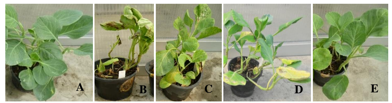
Figure 1. In vivo antifungal activities of plant extract against A. brassicicola . Chinese kale were inoculated with spore suspensions of the test organism 1 day after spraying with the various plant extracts at concentration of 10,000 ppm for 30 days after planting (A) untreated plant (healthy); (B) treated with distilled water; (C) treated with H. anthelminthicus extract; (D) treated with X. lanceatum extract and (E) treated with C. brachiata extract.